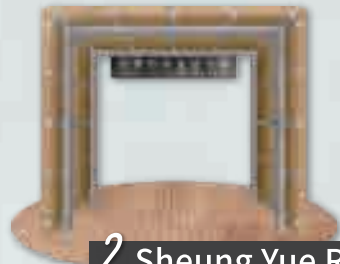
2 Sheung Yue River Entrance