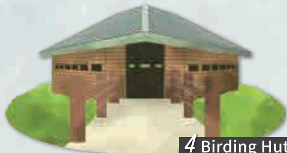
4 Birding Hut