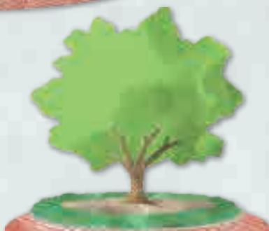
6 Long Valley Plaza