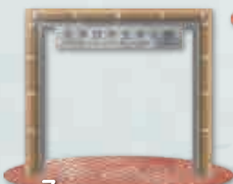
7 Yin Kong Entrance