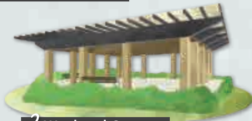
3 Wetland Square